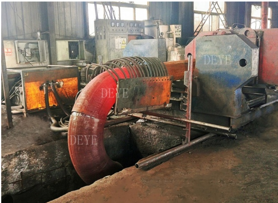
ELBOW Shaper Machining