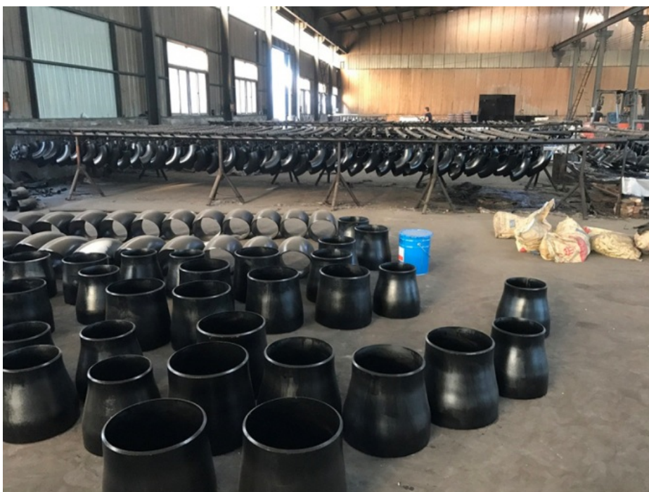
Package For shipment