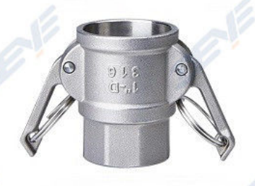
316 $$ Camlock lever coupling Female snaplock coupler inner thread