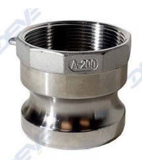
316 SS Camlock quick coupling Male camlock adaptor inner thread