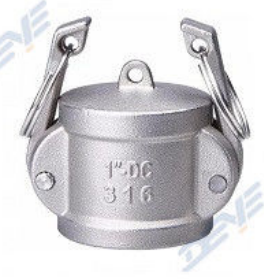
316 INOX Camlock Dust cap