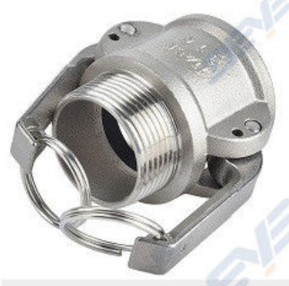
316 SS Camlock coupler Female camlock coupler outer thread